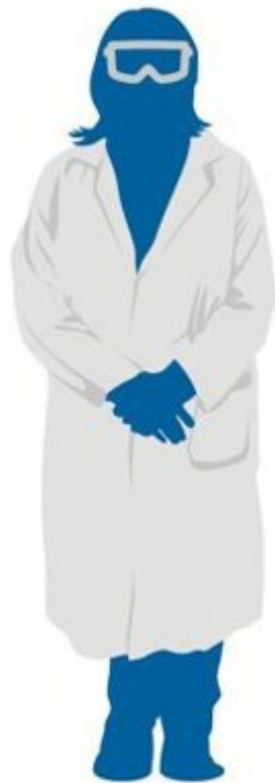
ANNUAL TRAINING HOURS PER EMPLOYEE